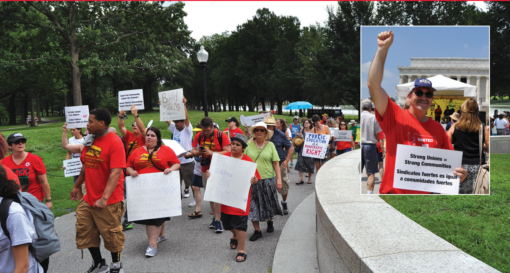
Thousands of educators, parents and students gather every summer at the grassroots Save Our Schools march on Washington, D.C. The core issues: equitable funding for all public schools, an end to high-stakes testing, professional, diverse educators, child-centered, culturally appropriate curriculum.

The Save Our Schools People's March in Washington, D.C. happened the day after five Dallas police officers were killed at the end of a peaceful protest march, protesting the killing of two black men. The previous day, Philando Castile, a support staff member in a school lunchroom was killed during a traffic stop in Minnesota. And the day before that, Alton Sterling was killed by police in Baton Rouge. In the hours before news from Dallas hit, Jonathan Kozol turned to me and said, "I think I should say something in my speech tomorrow." Nearly everyone did. The SOS rally and march felt heavy with the injustice of all the violence. Yet it focused our message and energized us to continue the fight.