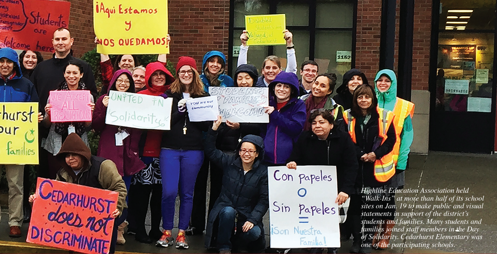
Highline Education Association held "Walk-Ins" at more than half of its school sites on Jan. 19 to make public and visual statements in support of the district's students and families. Many students and families joined staff members in the Day of Solidarity. Cedarhurst Elementary was one of the participating schools.