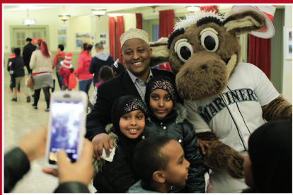
More than 600 students and their families from 15 public schools in Seattle and Highline were treated to a March 1 gala featuring performers and readers who shared their love of reading in honor of Read Across America.